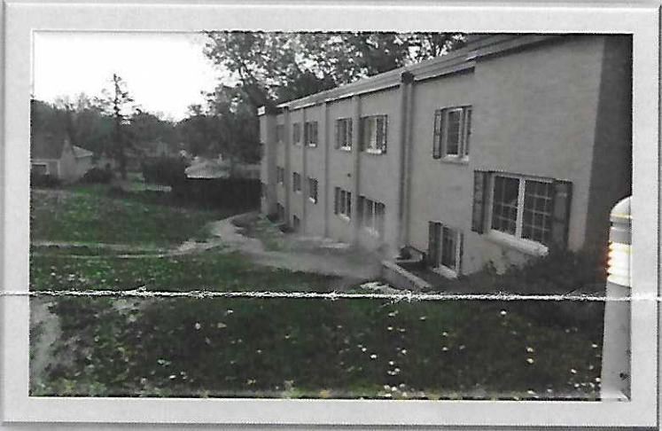
Is this snow? View from inside Crowell Home.