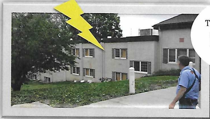
The EIFS, windows and shutters are left in shambles.